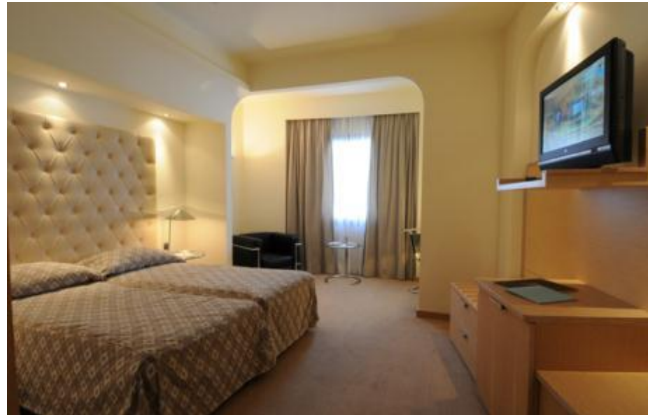
Executive Mountain View Room