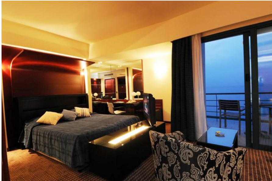
Deluxe Sea View Room